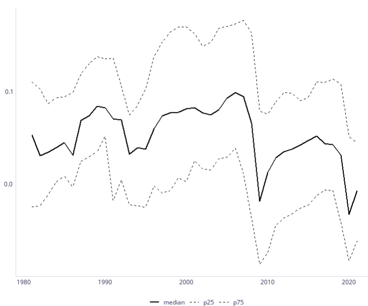
Figure 2: Developments of the fiscal response coefficient, 1980-2021