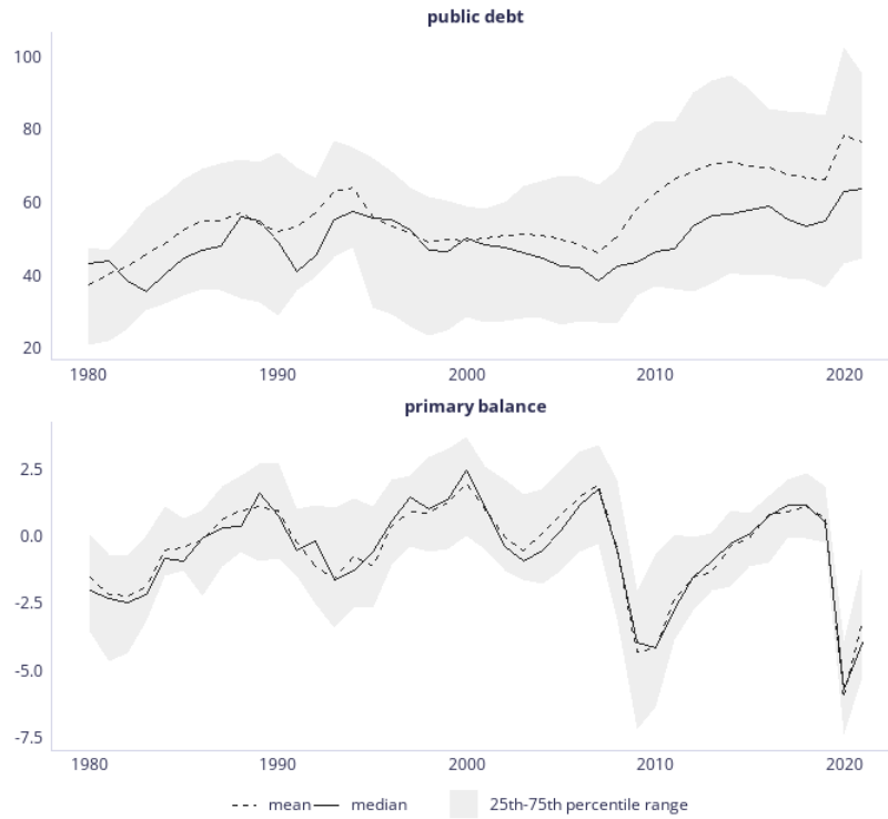
Figure 1: Primary balance and public debt in OECD countries, 1980-2021